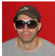
No hats or sunglasses