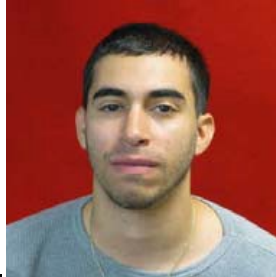
Acceptable Photo →

Below are several examples of unacceptable photos, that will be denied and will delay processing.